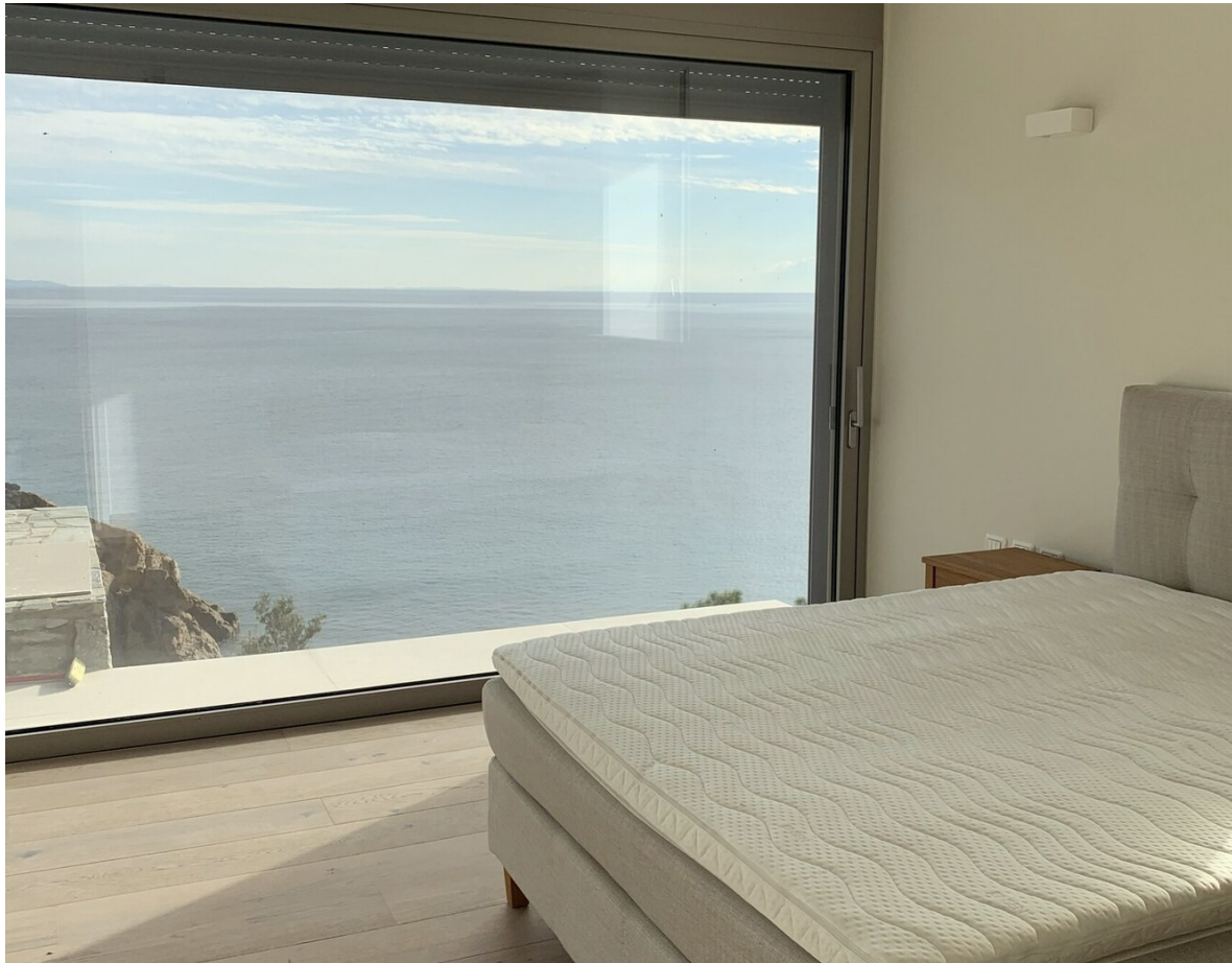
– Sea-view bedroom · floor-to-ceiling Aegean

Each of the three bedrooms is en-suite. Two on the main floor open onto the garden and the cove; the master, on the upper floor, faces the open sea through a wall of glass.