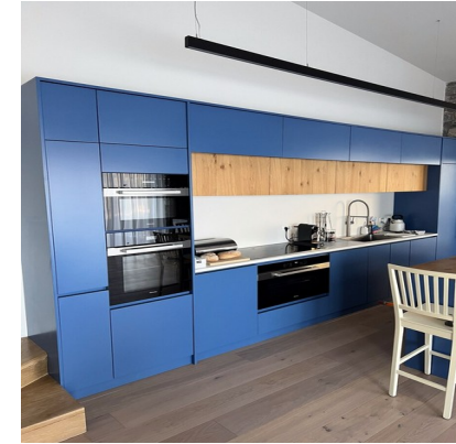
— Miele appliances · stone wall