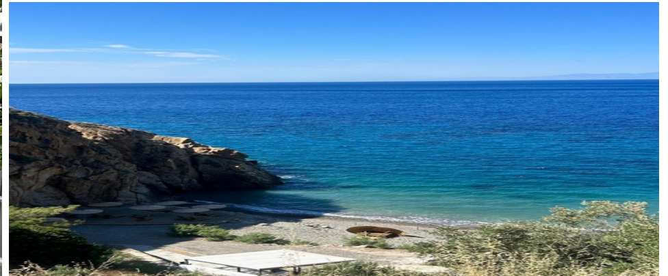
— Path down to the private beach