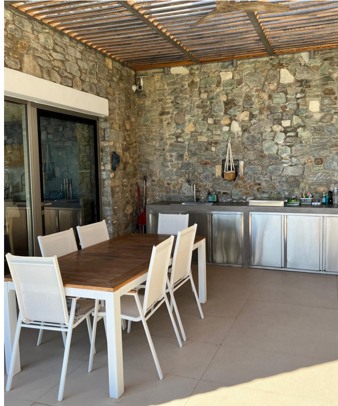
— Outdoor kitchen · dining for eight