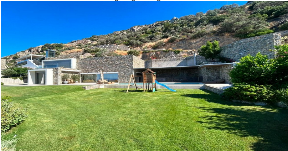
– Lawn · playground area