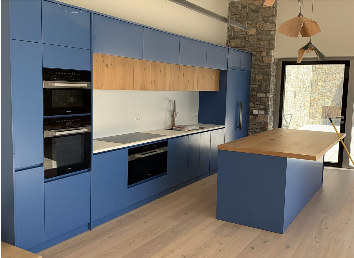
— Miele kitchen · oak island · two ovens, two dishwashers

A double-height living space with a fully equipped Miele kitchen — two dishwashers, two ovens, microwave, large fridge/freezer — opening directly onto the pool terrace through floor-to-ceiling glass.