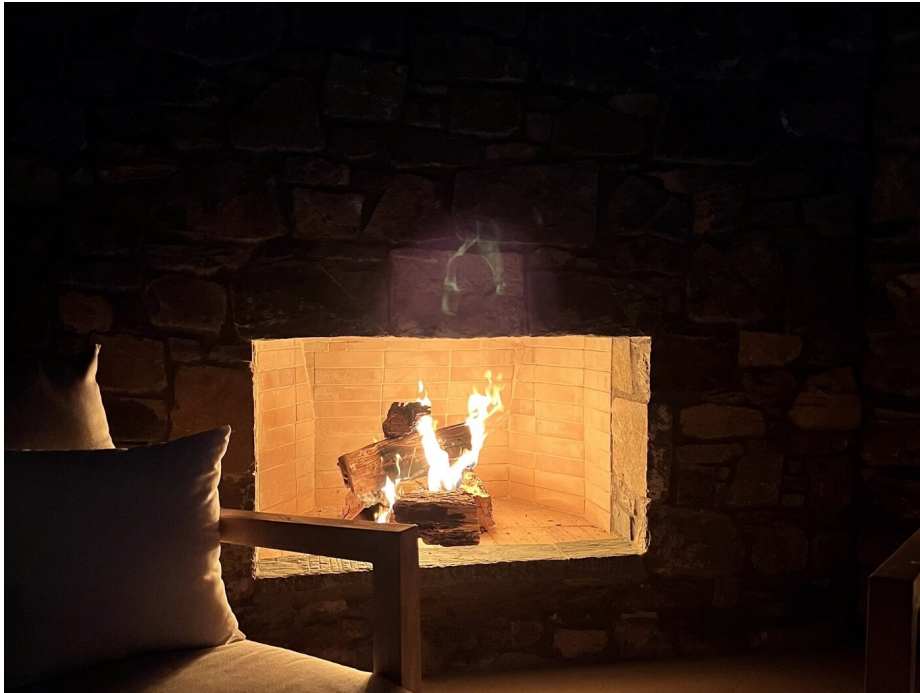
— Wood fireplace · pergola lounge at night

Sunset Cliff is not only a summer house. The villa has two fireplaces — a hand-built wood-burning fireplace in the covered pergola, and a clean bio-ethanol fireplace in the master suite — making it as inviting in January as in July. Lesvos winters are mild and quiet; the south coast catches the low winter sun all day, and the villa is fully heated.