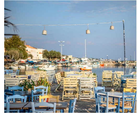
– Waterfront tavernas · dusk