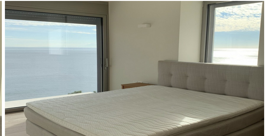
– Corner sea-view bedroom · two windows