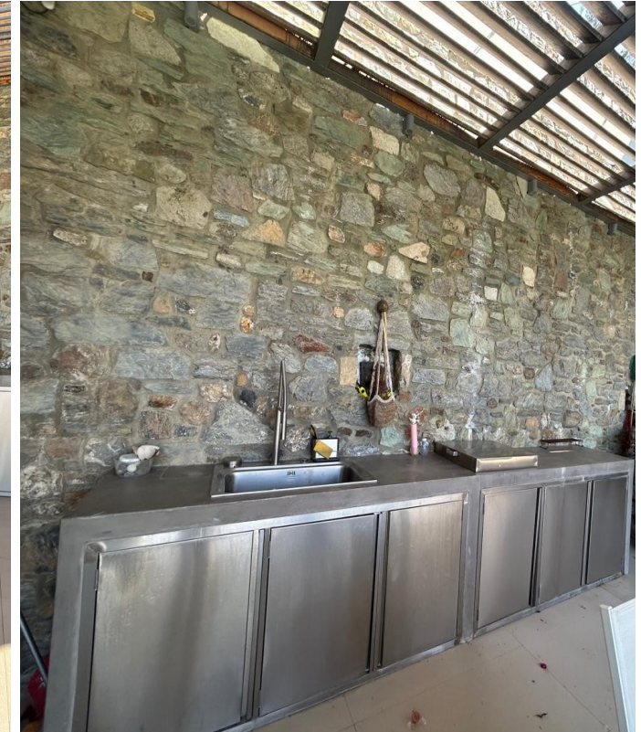
— Full outdoor kitchen · gas grill