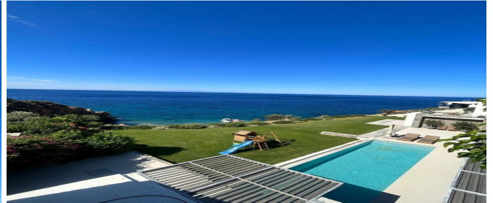
— Lawn, pool and cove