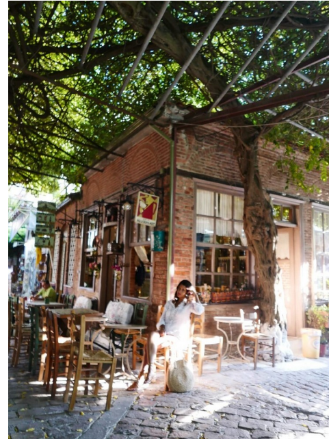
– Tree-canopy terrace