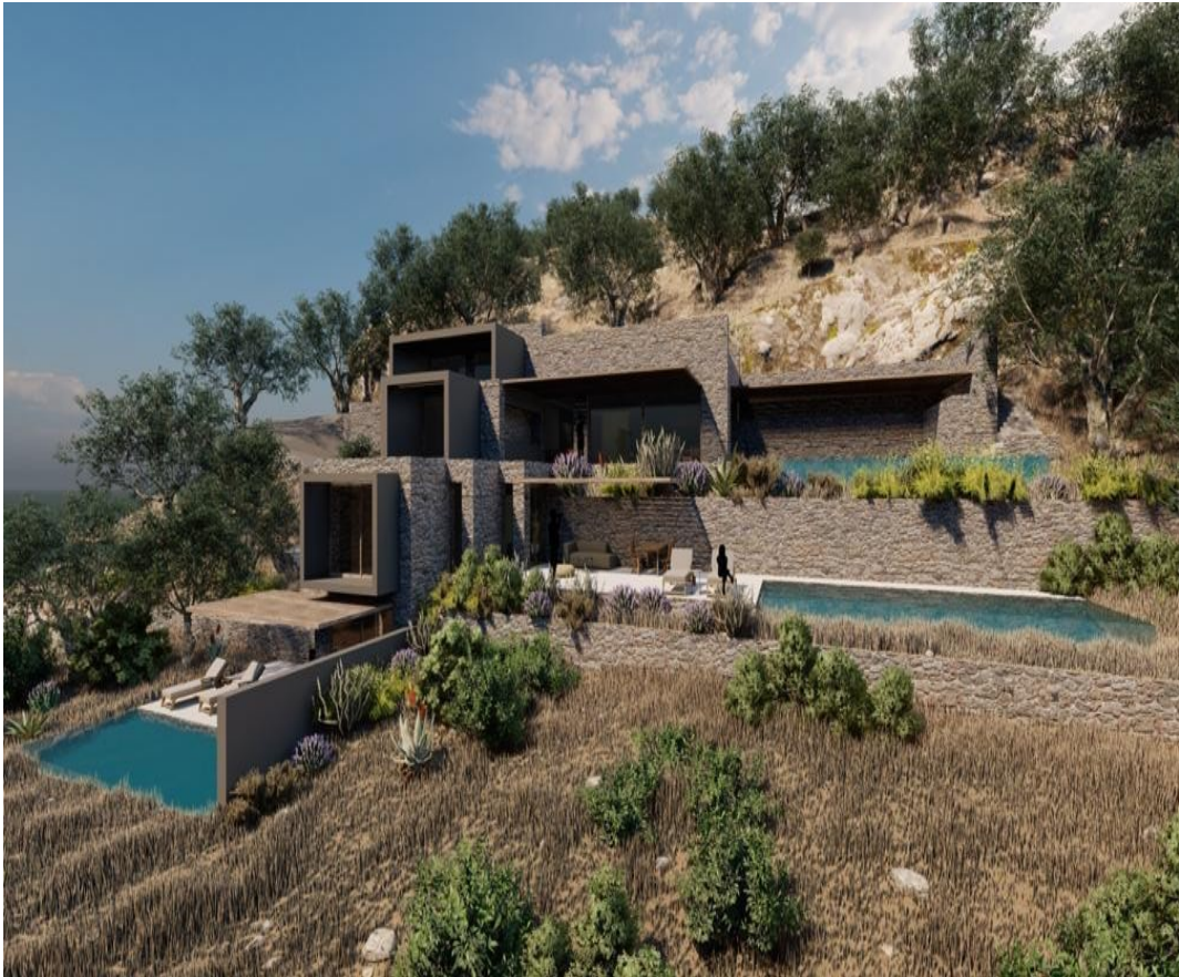
– The villa in its landscape · concept