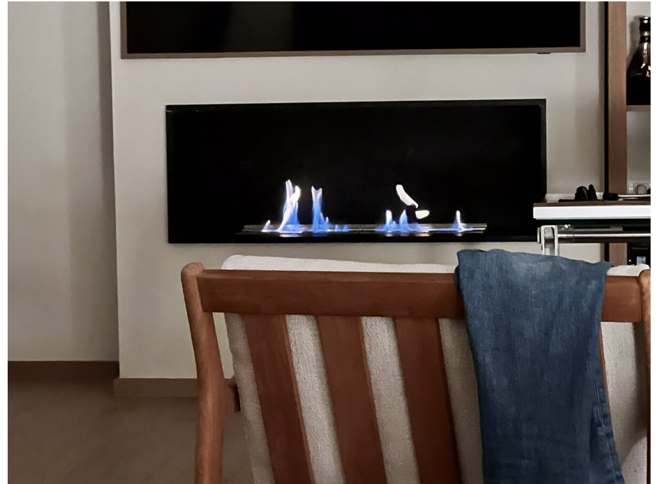
— Bio-ethanol fireplace · master suite (alight)