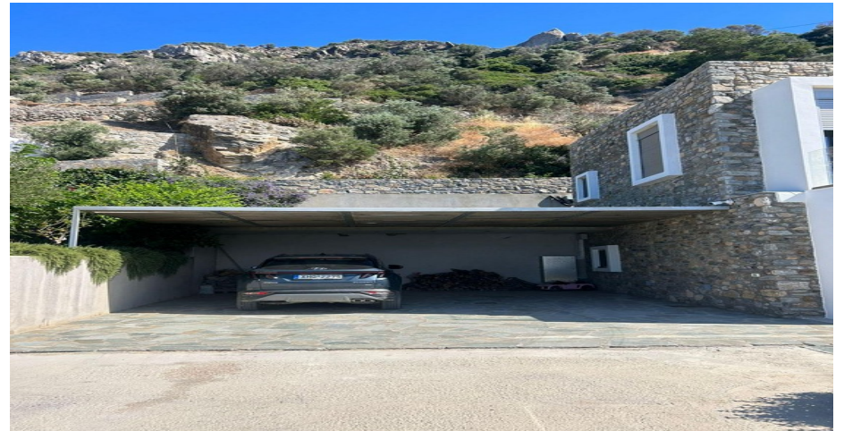
– Two covered parking bays · external storage