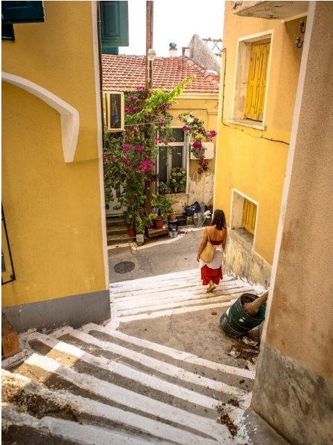
– Alley steps · bougainvillea

A short drive from Sunset Cliff: cobbled alleyways shaded by vines and bougainvillea, kafenia where the same chairs have been pulled out at the same hour for generations, and a working harbour lined with tavernas that face the sea at sundown.