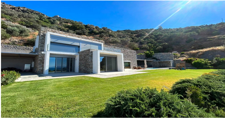
– Front elevation · double-height glazing