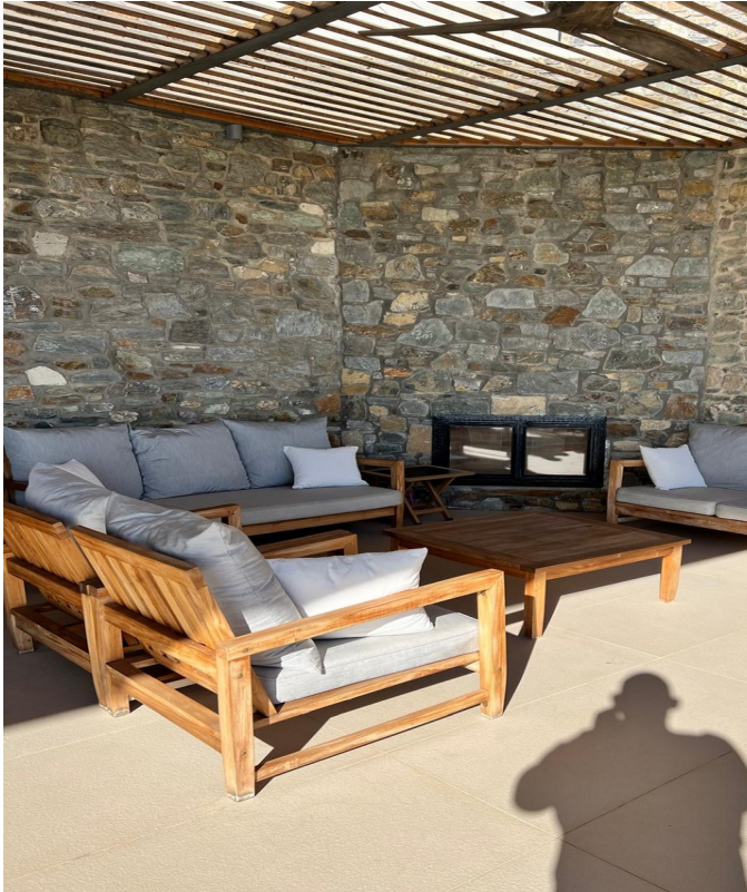
— Stone fireplace · lounge

Covered, lit, and oriented toward the sea. An outdoor kitchen, a built-in gas barbecue, a stone fireplace, and seating for ten under a cedar lattice that filters the Aegean light.