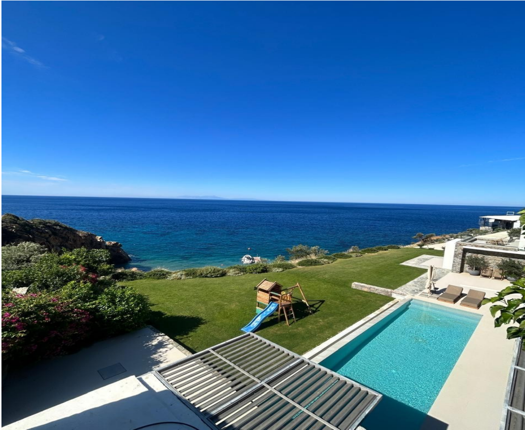
— From the upper terrace · cove and horizon

The plot extends from the road down to the water in three terraced levels — lawn, swimming pool, and a private pebble beach in a protected cove.