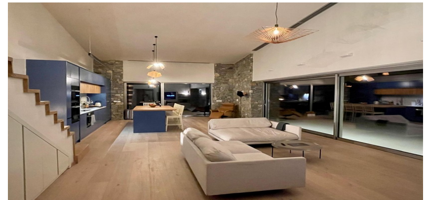
— Double-height living · open to the terrace