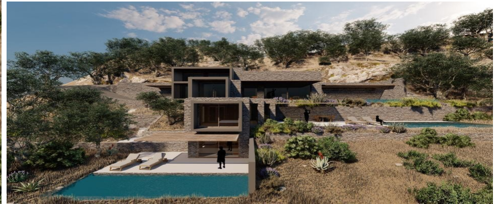
– Building geometry