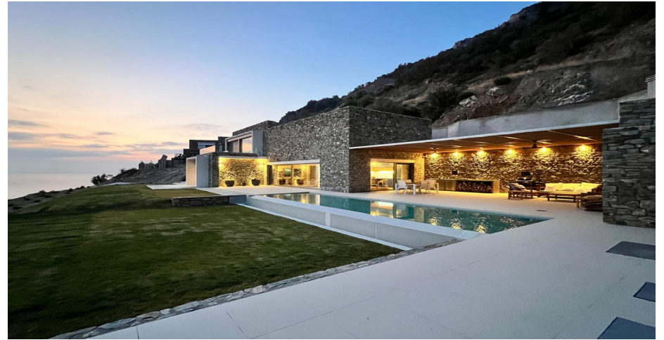
– Poolside at dusk