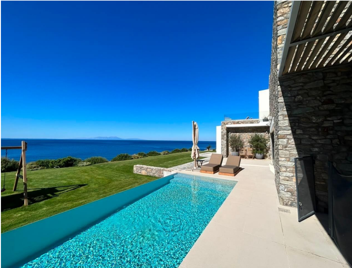
— Twelve-metre lap pool · uninterrupted sea views