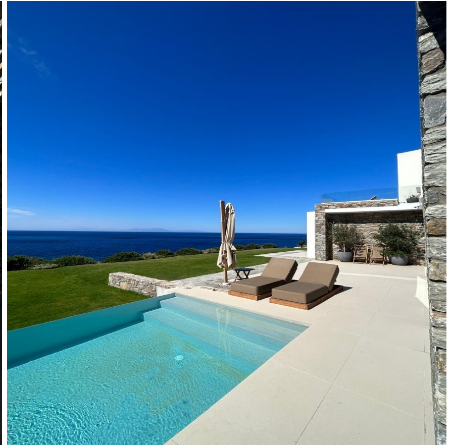
— Sun terrace