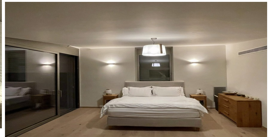
– Master suite · warmly lit at night