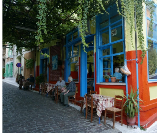
– Village kafenio · midday