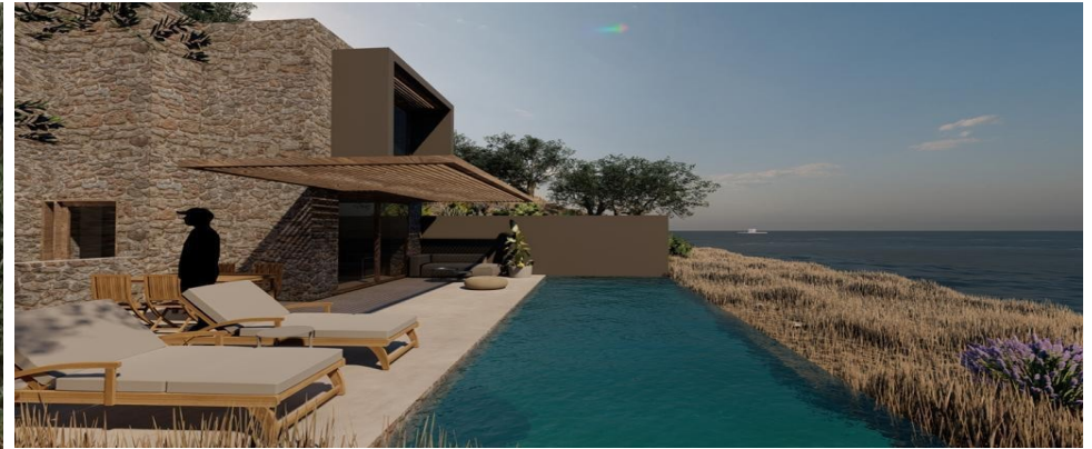
– Pergola & seaside pool